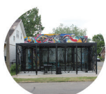
DESIGNING FOR SHARED SPACES