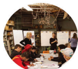
STAKEHOLDER ENGAGEMENT FOR BUILDING + PLAZA PROGRAMS