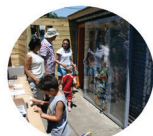
STUDENT + COMMUNITY DESIGN BUILD