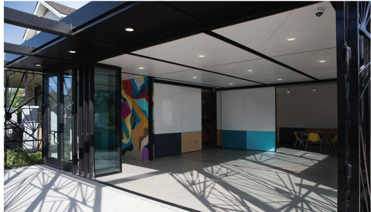
Shared Space in Open Configuration

Avis + Elsmere is sited in a social context that uses it as a point of departure and a goal post. The project is a living organism composed of a multitude of people and perspectives constantly shifting direction.