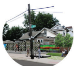
PROPOSED PLAZA WILL CONTINUE THE LIFE OF THE NEIGHBORHOOD