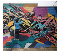
Murals by Alumnus of the Youth Program