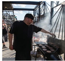
Front Porch Activated by Neighbors