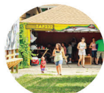
PLACEMAKING THROUGH TEMPORARY INTERVENTIONS + STUDIO PROJECT