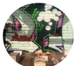
STAKEHOLDER REVIEW OF BUILDING + PLAZA DESIGNS + DESIGN DEVELOPMENT