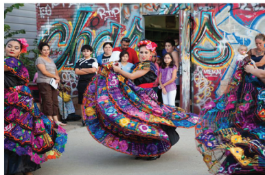
Community Event to Review Schematic Design