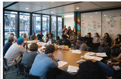
Event in New Space