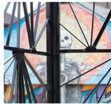
Detail of Locally Fabricated Screen